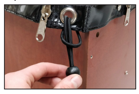
Step 4. Mount the elastics on the tent

Mount the four elastics (5) on the tent.