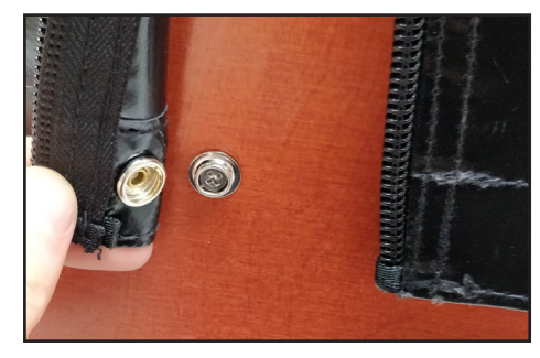
Step 6. Mount the press studs

Allign the press stud with the stud on the box and mark the position. Now mount the press stud with the included screws. Repeat this step for al four sides of the tent.